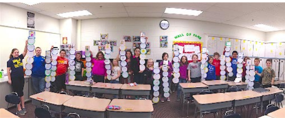
The Paulding Elementary fourth graders just completed a unit on Mythology. Some of the students are shown with a fun research project they just completed.