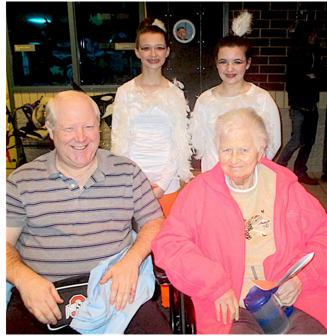
Vancrest residents enjoying the AHS production of The Little Mermaid . The residents all agreed that the cast and crew did a great job in this production.