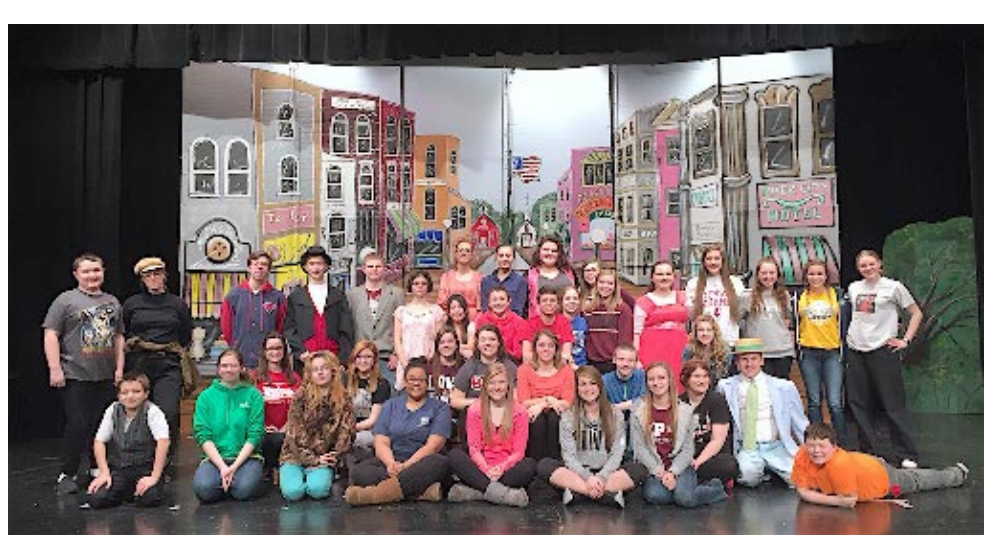
The Paulding High School presented Meredith Willson's the Music Man this past weekend. This musical presented the citizens of River City, Iowa who found their town in trouble. Traveling salesman, Harold Hill was trying to sell instruments to start a boys band in their quiet town. It was a quite a show!