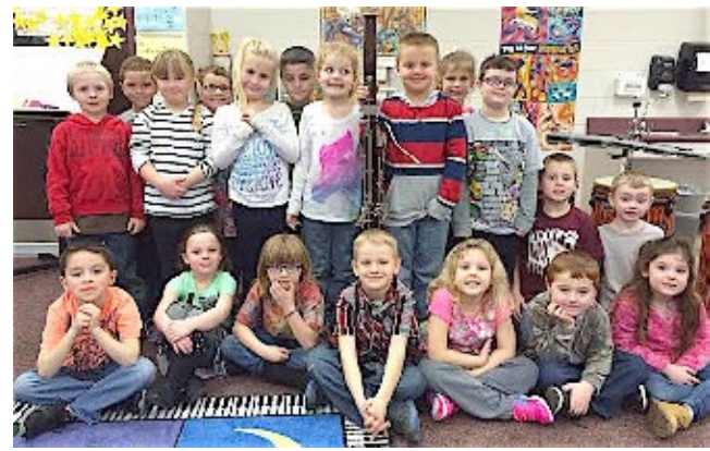
The Oakwood Elementary Kindergarten class called the KA Smarties recently learned about the bassoon in Mrs. Wehrkamp's music class during "B" week. They are shown here with a bassoon in the middle. None of the KA Smarties are as tall as a bassoon, but they all think they will be taller than a bassoon some day!!

summer months. During program children participate in math, science and reading activities in the morning and recreational activities in the afternoon. The program also offers swim days and field trips.