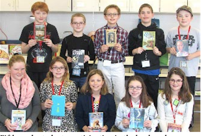
Fifth grade students participating in the book exchange