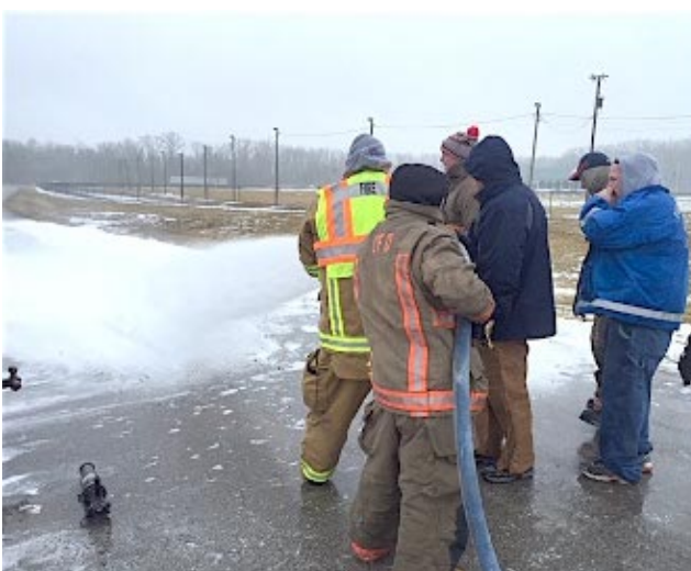
Pictured here: Cecil Fire department provided a pumper for the class and the EMA Regional Foam Trailer was brought over, from Defiance County EMA to train with.

The Paulding County Emergency Management Agency held a Firefighting Foam Operations Class on Saturday. 15 firefighters from (5) fire departments in the county participated in the class. Some of the topics throughout the morning session, ranged from the different types of foam and uses. Application techniques to be used for vapor suppression of flammable liquids or fighting flammable liquid fires.