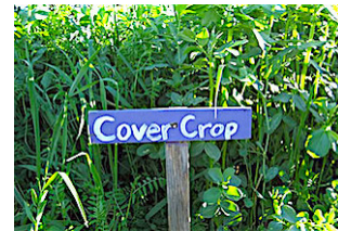
By: Staci Miller, Education Specialist, Paulding SWCD

Due to recent high winds and erosion around the county, cover crops have become a topic of discussion. Cover crops have the ability to help improve soil and water quality. There are a variety of different soil quality benefits of cover crops which include soil erosion protection, reduced nutrient leaching, carbon sequestration, weed suppression, integrated pest management and addition of valuable organic matter. Cover crops can also help to protect water quality by reducing losses of nutrients, pesticide and sediment. Only a small percentage of farmers in Paulding County are utilizing cover crops on their farms.