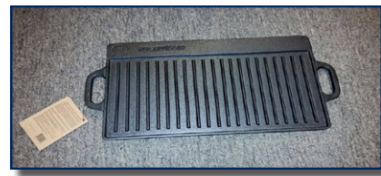
$25 / 2 BURNER - CAMPFIRE REVERSIBLE GRIDDLE *ONE SIDE SMOOTH, OTHER SIDE RIDGED*