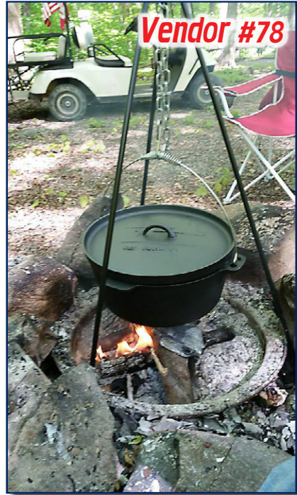
$65 / 8 QUART DUTCH OVEN ($80 WITH TRIPOD) $95 / 12 QUART DUTCH OVEN ($110 WITH TRIPOD) $20 TRIPOD ALONE