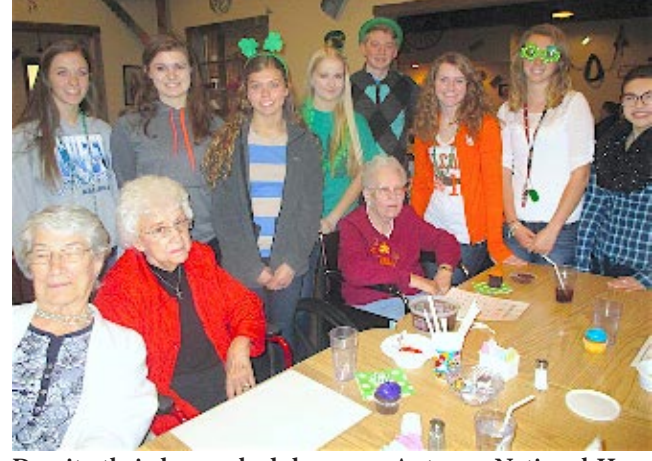
Despite their busy schedule, many Antwerp National Honor Society students spent the afternoon with the residents of Vancrest playing Bingo and serving refreshments. Vancrest appreciates all that the Antwerp students and staff do for the Vancrest facility.

Minister Bruno Rodríguez, as well as with Cuban farmers, producers and operators of agricultural cooperatives and markets. Secretary Vilsack will use this second trip to Cuba to discuss opportunities for collaboration in agriculture among the United States and Cuba, better understand how climate change is affecting agricultural production in Cuba, and continue to help American businesses interested in exporting to Cuba form and strengthen ties to the Cuban people and culture. "Throughout history, agriculture has served as a bridge to foster cooperation, and I have no doubt that agriculture will continue to play a powerful role as we expand our relationship with the Cuban people in the coming years," said Secretary Vilsack.