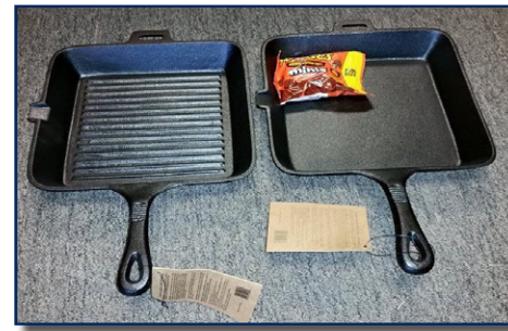
$21 SINGLE PAN $36 / SET OF 2 *RIDGED PAN FOR MEAT* **SMOOTH PAN FOR PANCAKES, ETC** ***ITEM IN PAN THE SIZE OF A HAMBURGER***