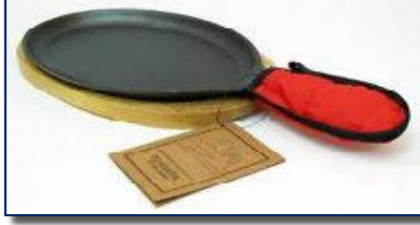
$16 SINGLE FAJITA PAN $28 / SET OF 2 FAJITA PANS ($14 EACH) $36 / SET OF 3 FAJITA PANS ($12 EACH) $40 / SET OF 4 FAJITA PANS ($10 EACH) *INCLUDES WOOD BASE & MITT*