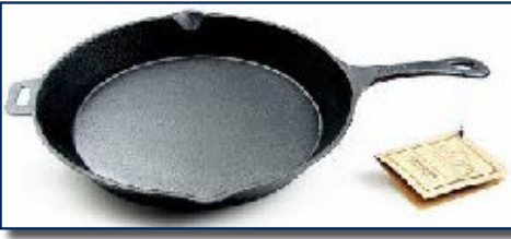
12 INCH SKILLET ($20) 15 INCH SKILLET ($35) 12 & 15 INCH SKILLET COMBO ($50)