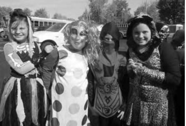
Payne Elementary students and staff participated in their annual Halloween Parade on October 28. Students and staff enjoy this parade by walking downtown each year.