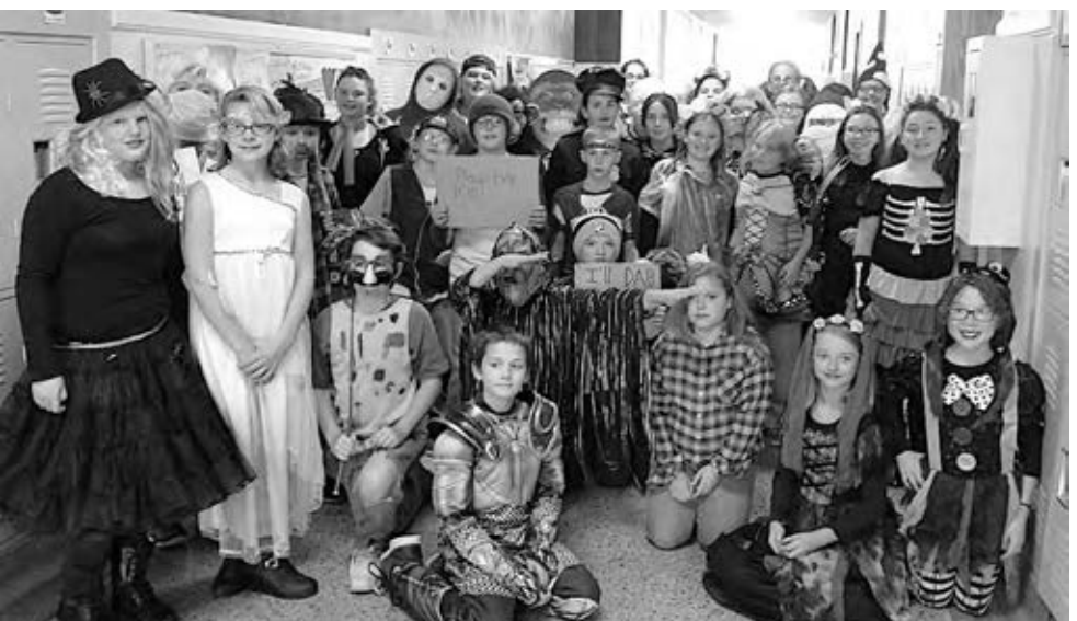
The 6th graders of Payne Elementary celebrated Halloween on Friday by participating in house activities, walking in the parade, and having parties with their homerooms.