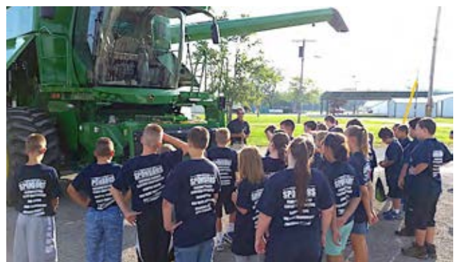
Fifth grade students from Payne Elementary participated in the annual Paulding County Soil and Water Conservation District Field Day. The event was held at the Paulding County Fairgrounds.