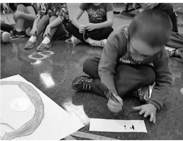
Kindergartener Dakota Kline adds labels to the class pumpkin poster.