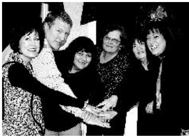
A portion of the 82 Community Health Professionals employees recognized for 10 or more years of service to the area nonprofit, home health and hospice organization.

Community Health Professionals home health and hospice recently honored 82 employees with 10 or more years of service to the organization's three affiliated nonprofit corporations and 12 offices in Northwest and West Central Ohio.