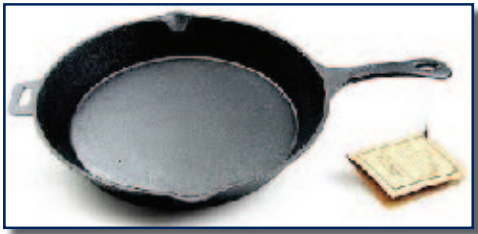
12 INCH SKILLET ($20) 15 INCH SKILLET ($30) 12 & 15 INCH SKILLET COMBO ($45)