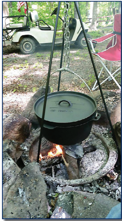
$60 / 8 QUART DUTCH OVEN $90 / 12 QUART DUTCH OVEN $15 ADD TRIPOD TO A DUTCH OVEN $20 TRIPOD ALONE