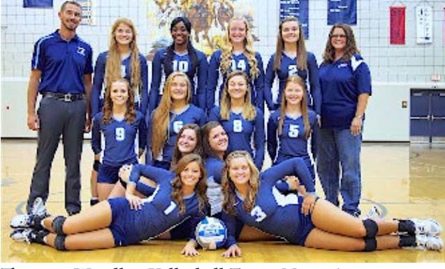
The 2015 Woodlan Volleyball Team. More pictures at westbendnews.net

Bluffton defeated Adams Central in three sets: 25-22; 25-16; 25-17 in the first match of the Woodlan volleyball sectional.