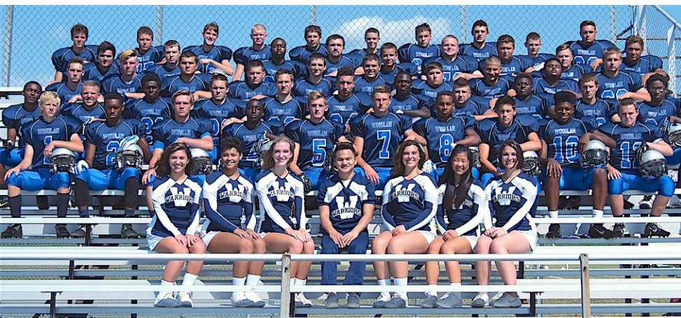
The 2015 Woodlan Football team. More pictures at westbendnews.net

The Warriors went to Noble County to take on Central Noble for the first game of the tournament. Woodlan just came off an undefeated regular season with the win against the previously undefeated Adams Central Jets.