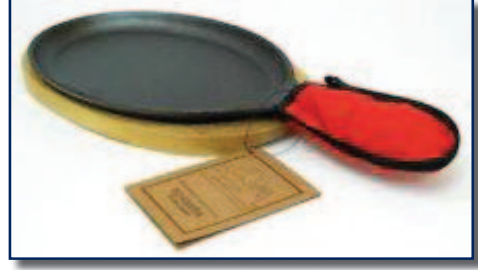
$16 SINGLE FAJITA PAN $28 / SET OF 2 FAJITA PANS ($14 EACH) $36 / SET OF 3 FAJITA PANS ($12 EACH) $40 / SET OF 4 FAJITA PANS ($10 EACH) *INCLUDES WOOD BASE & MITT*