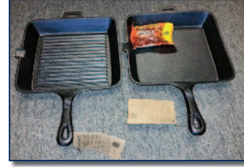
$20 SINGLE PAN $35 / SET OF 2 ($17.50 EACH) *RIDGED PAN FOR MEAT* **SMOOTH PAN FOR PANCAKES, ETC** ***ITEM IN PAN THE SIZE OF A HAMBURGER***