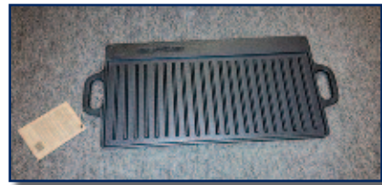
$25 / 2 CAMPFIRE REVERSIBLE GRIDDLE *ONE SIDE SMOOTH, OTHER SIDE RIDGED*

ALL CAST IRON ITEMS ARE PRESEASONED. DELIVERY AVAILABLE. GIVE US A CALL TO SCHEDULE A PICK UP IN MONTPELIER, OHIO (NO SHOW ROOM). (419) 630.4305 OR LOOK US UP ON FACEBOOK: FORREST & SON'S TREASURES