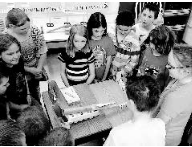
The 4th grade students at Payne Elementary recently explored energy and its ability to transfer from one object to the next. Students worked with a partner to design and construct a device that caused a box to be knocked over and involved energy transfer between four or more objects.