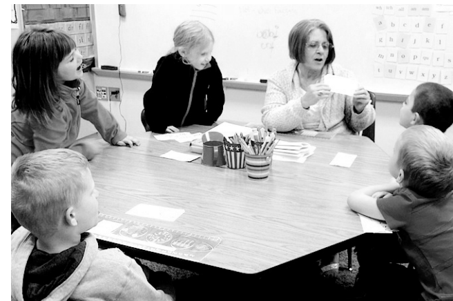
First grade students at Payne Elementary in Mrs. Head's classroom practice reading sight word phrases. They have been learning to read words with a long vowel sounds.