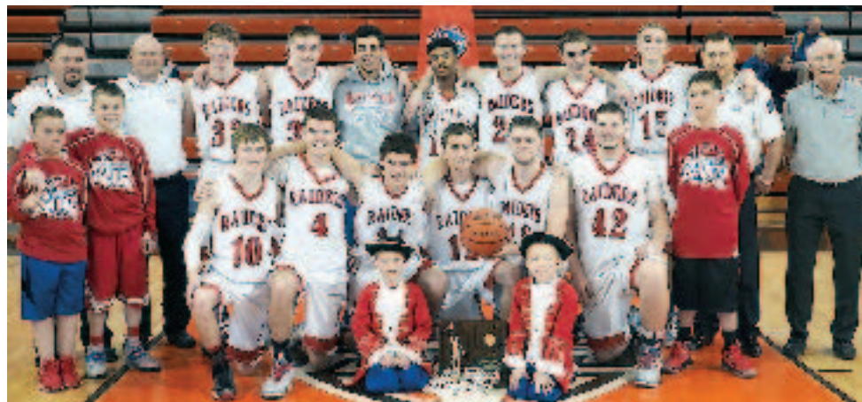
2015 is the winningest season for Wayne Trace Boys Basketball Program after defeating Delphos St. John's in the Regional Championship game.