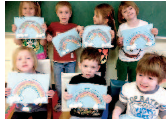
Preschoolers at Divine Mercy Catholic School are the rainbows in our lives.