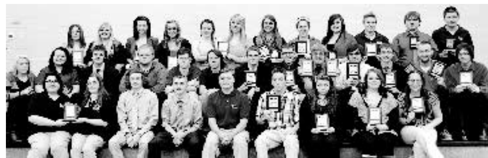
Vantage Business Professional of America (BPA) 2015 state qualifiers!

Vantage Career Center recently hosted the first round of Region 16 Business Professionals of America (BPA) skills contests. Fifty students from the Vantage business programs - Interactive Media, Medical Office Management and Network Systems - competed in a variety of different contests including PC Security, Java Programming, Medical Office Procedures, Computer Modeling, Computer Animation, Network Design, Advanced Office Systems and Procedures, Administrative Support, and Parliamentary Procedures. This year, 33 students earned the right to advance to the state competition held in Columbus in the spring.