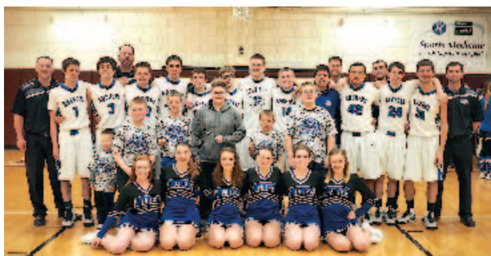
Antwerp's 2015 Boys Basketball Sectional Victory! More pictures at westbendnews.net

Back at the beginning of the year, Stryker travelled to Antwerp to take on the Archers. In January the Panthers won by 11 points.