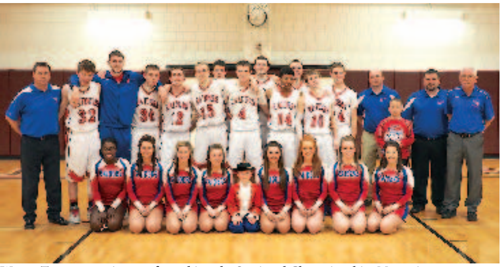
Wayne Trace team picture after taking the Sectional Championship. More pictures at westbendnews.net

The Raiders, steeped in victory for the regular season, is seeded number one in their District bracket. The sectional championship began following the North Central surprise defeat of Hilltop.