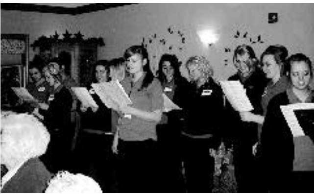
Vantage Health Technology students also visited the County Inn Assisted Living and Nursing Home in Paulding to spread some holiday cheer.