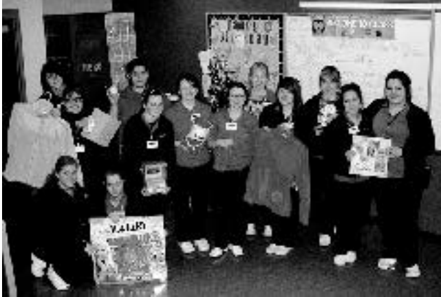
Vantage junior and senior Health Technology students adopted a family for Christmas! Here, some of the juniors show the gifts they bought.