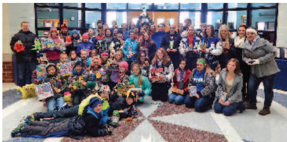
Elementary, middle, and high school student council members before they load the gifts in the bus.

Students at Antwerp Local School did their part to help fill the bus at the West Bend News parking lot on Tuesday, November 18 th for the Christmas for Kids live drive. Students brought in personal donations, the elementary student council sponsored a hat day to purchase more toys, and the middle and high school student coun-