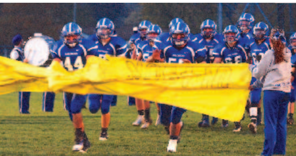
The Archers come out on the field against Fairview. More pictures at westbendnews.net