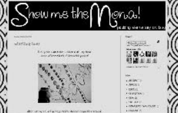
Did you know the Paulding Elementary Art Classes have their own blog? Go to www.showmethemona.blogspot.com to see all of the latest art projects and adventures in the Art Room. Be sure to click on "Join the Site" to keep up with all of the newest posts throughout the year!

are not funded by Hoosiers' tax dollars, but instead by fines imposed on violators of securities laws.