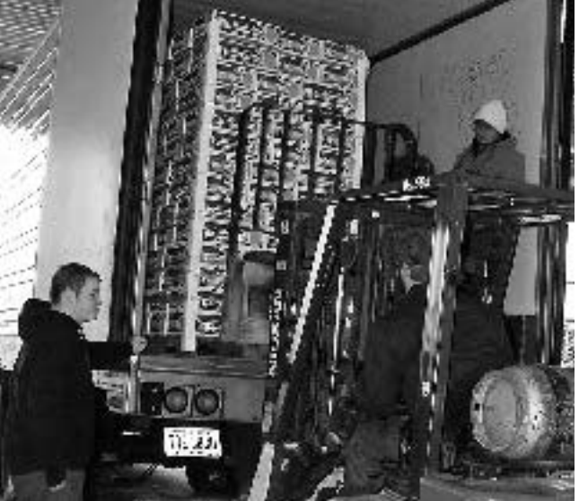
Former Vantage Ag students prepare to unload some of the fruit they sold in this picture from 2013.

Vantage FFA says, "It's time to order your fresh fruit from the Florida Fruit Association of Vero Beach, Florida." This fruit event is underway now and ends on Friday, November 6. The Vantage FFA coordinates this school-wide event. Money earned is used by students who compete in regional, state and national competitions, as well as for community service projects, field trips and banquets. This year, the following fruit is available: Navel oranges, full and half case; Hamlins, full and half case; Red Grapefruit, full and half case; Tangelos, full and half case. Also available is a mixed fruit