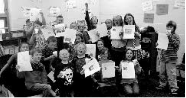
Third graders at Oakwood Elementary recently completed writing a personal narrative. The students celebrated and shared their stories with a publishing party. Pictured here some of the students are showing off their work.