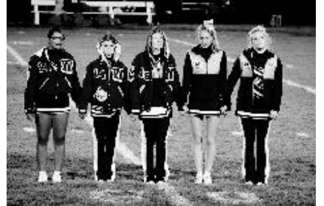
Woodlan's Cheerleaders are honored at the last home football game for their outstanding performances. More pictures at westbendnews.net

The individual stunt group has also been hard at work. They placed third out of five schools at camp. After that, they pushed themselves to win first at Purdue's Get