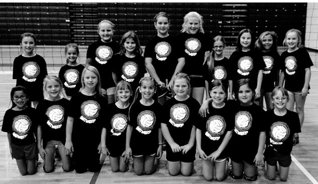
Girls in grades 1-4 at Antwerp participated in our Mini Archer volleyball program during the month of September. They learned basic skills, teamwork, and how to stay

positive. Pictured in the top photo is the first and second graders. In the bottom picture are the third and fourth graders.