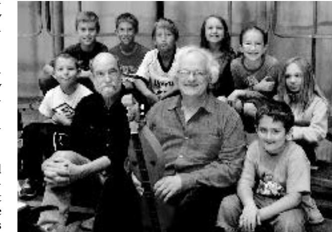
Students at Payne Elementary were treated to an interactive folk music concert by the group Mustard's Retreat on October 9.