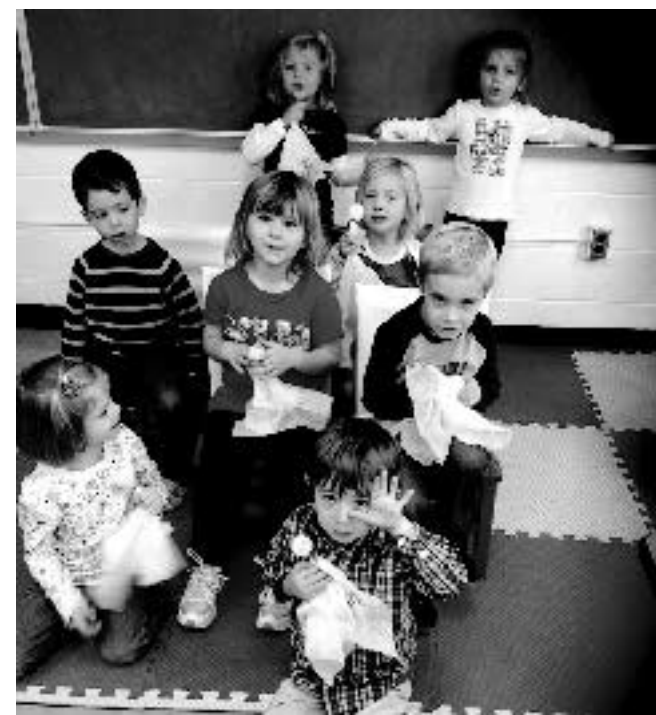
Divine Mercy Preschool is getting into the swing of Halloween!