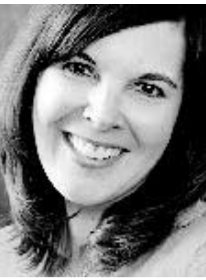
The Nurturing Well by: Jill Starbuck

Nearly everybody faces the cost obstacle when it comes to medication. Prescription medication is often exorbitantly priced, especially brand name drugs. Overall prescription drug spending rose 3.2% to nearly $330 billion in 2013. As spending continues to increase, so does the number of Americans who cannot afford their medications at approximately one in five.