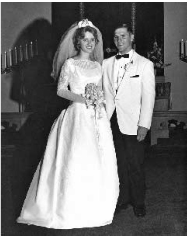
(Continued from Page 1)

"But those who hope in the Lord will renew their strength. They will soar on wings like eagles; they will run and not grow weary, they will walk and not be faint." Isaiah 40:31