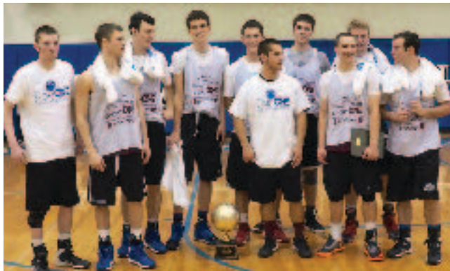
The Ohio Boys pull off a comeback to win the game.

The First Annual Tournament of All-Star Basketball Players took place on Saturday, April 5 at AHS. Antwerp, Ohio Athletic Director pulled off two great games between Ohio and Indiana boys and girls Basketball players. The