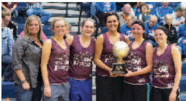
The Indiana Girls win the game.