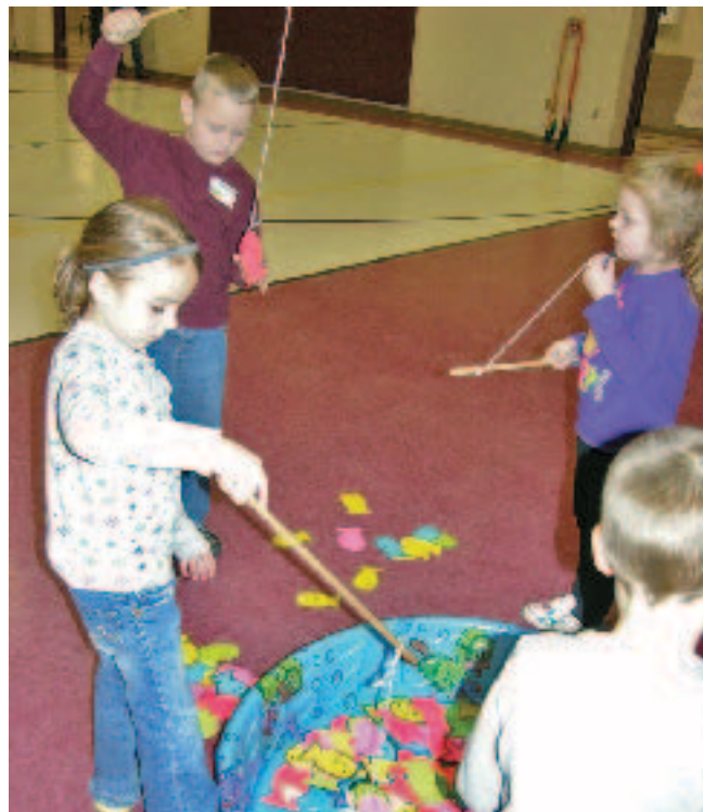
Oakwood Elementary is gearing up for a new school year! Kindergarten Camp was on March 13 th . The teachers really enjoyed getting to meet some new faces for the 2014-2015 school year. Campers were able to complete a project, listen to stories and even go fishing! If you missed Kindergarten Camp at Oakwood Elementary, you can still call the office for a screening appointment. Oakwood Elementary Kindergarten Screening is scheduled for April 11 th .