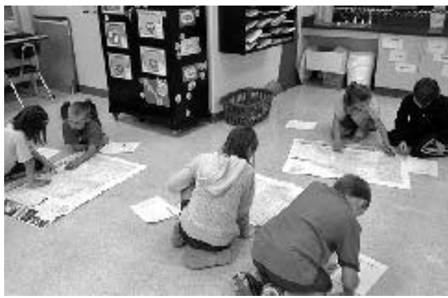
Third grade students at Payne Elementary are captured locating places on the Paulding County map in preparation for our Paulding County Historical Tour.