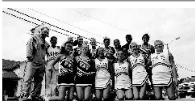
Woodlan High School Cheerleaders pose for The West Bend News at The Day in the Park Parade.

"He said to them, "But who do you say that I am?" Simon Peter replied, "You are the Christ, the Son of the living God." — Matthew 16:15-16 ESV