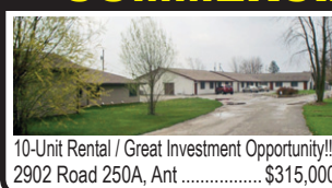
10-Unit Rental / Great Investment Opportunity!!! 2902 Road 250A, Ant..... $315,000