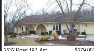
2532 Road 192, Ant..... $279,000