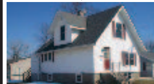
302 Baldwin St, Paulding..... $36,900