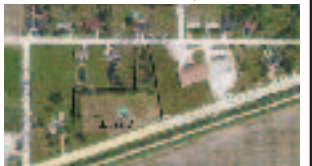
3.083 Acres on Rd 424, Ant..... $24,900