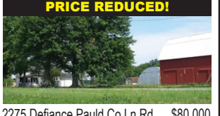
2275 Defiance Pauld Co Ln Rd..... $80,000