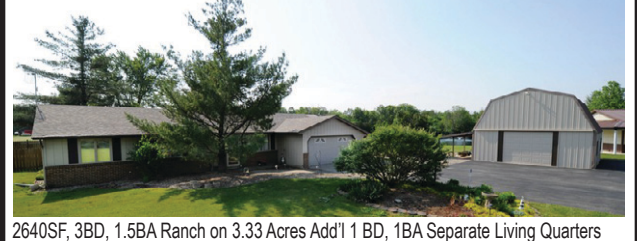
2640SF, 3BD, 1.5BA Ranch on 3.33 Acres Add'l 1 BD, 1BA Separate Living Quarters 24x24 Meyer Bldg. with Lofted Space 35x65 Pole Bldg w/ concrete floor, steps to loft 15015 Road 51, Antwerp ..... $269,900