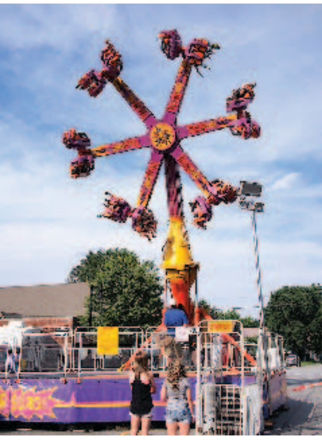
Watch the feature and see the pictures at www.westbendnews.net

For me, I walked in at the entrance where the Power Surge ride was setting. The young people were standing around waiting for their turn to be twisted and turned in the air, while on the edge of the street at the Strasbourg Room people were enjoying fine dining and drinks. In an informal poll the young people voted Power Surge as their favorite ride!