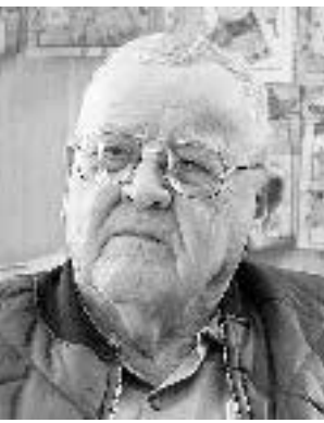
OLD DAN & I CHAPTER 40: STILL AT ZAMBOANGA