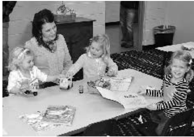
By: Beth Stauffer

On Sunday March 10 th , Central Lutheran School in New Haven, IN hosted an Open House for its brand new Preschool Program that is slated to begin in fall of 2013. The program boasts recently renovated, brightly colored, child-centric rooms on the lower level of Emanuel Lutheran Church located across the parking lot from Central Lutheran School on Green Street.