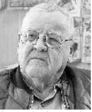
OLD DAN & I, CHAPTER 15: BACK FROM ENGLAND