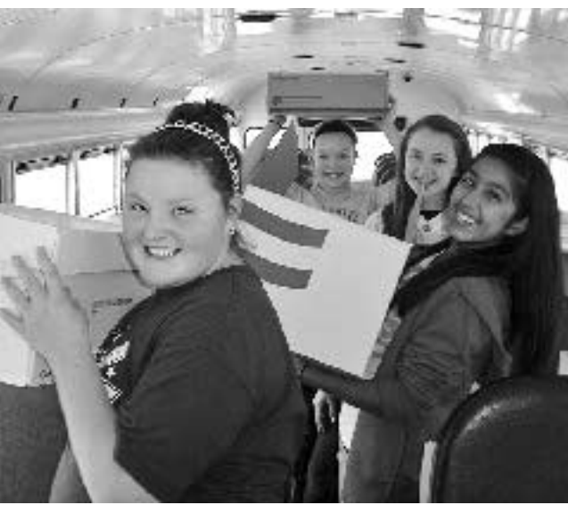
Paulding Middle School held their annual "Stuff the Bus" campaign to help the needy and to help re-stock the local Caring and Sharing Food Pantry. The middle school Student Council sponsored this annual event.