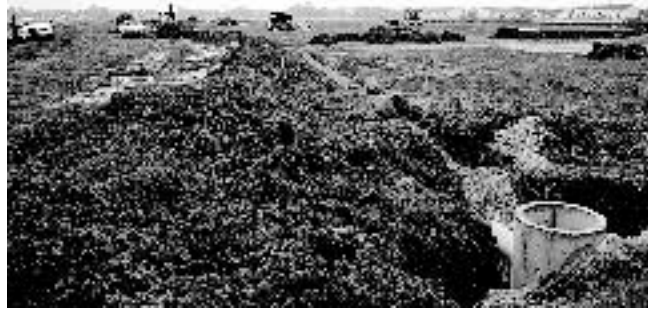
(Breaking Ground Continued from Page 1)