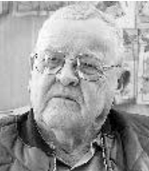
OLD DAN & I