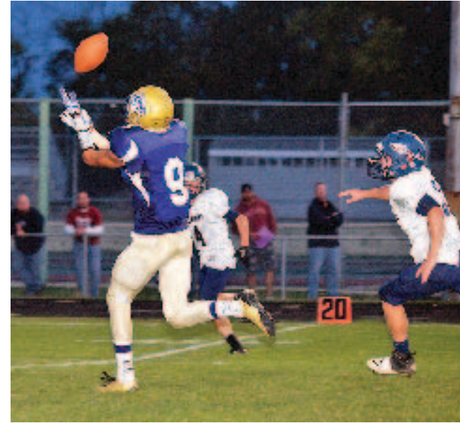
The football game was rather exciting as the Bulldogs took an early lead, but with not scoring in the fourth quarter and Belmont applying two TD's the game became a nail biter. NH finished at 27-24 and the win went to the home team.

The class of 1962 was honored during the first quarter (has it been 50 years already?) right before the king and queen were announced.