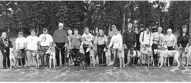
This is the group of people who attended the get-together and their dogs.