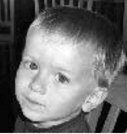
Love, Mom & Dad & Family