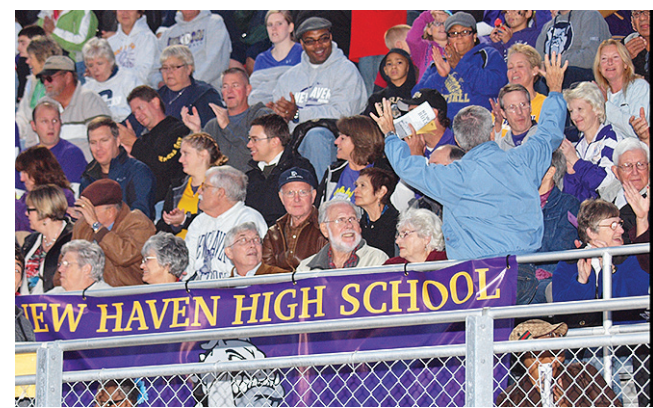
The Bulldogs celebrated their homecoming Friday, September 28. The fans who came were not disappointed. Along with the homecoming week celebrations and the parade, the Fort Wayne skydivers dropped four para-sailors who flew and all landed on the New Haven football field for a fantastic show marking the beginning of the game.

The class of 1962 was honored during the first quarter (has it been 50 years already?) right before the king and queen were announced.