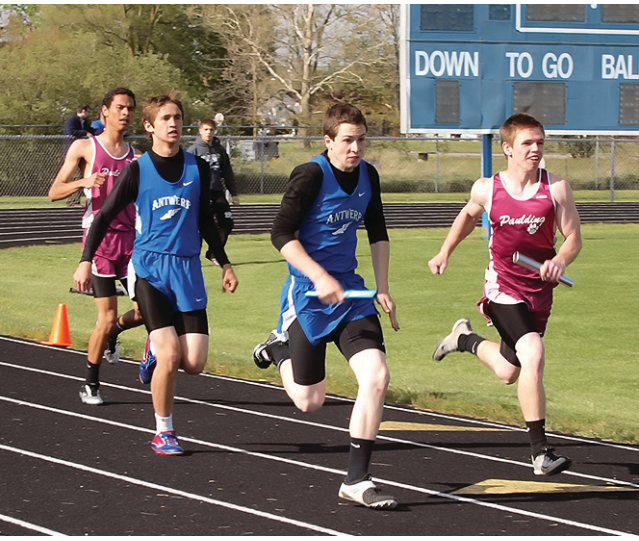
Antwerp hosted Paulding and Hicksville at the Thursday, April 26 track meet. Paulding finished first with Antwerp and Hicksville trailing. More pictures at www.westbendnews.net