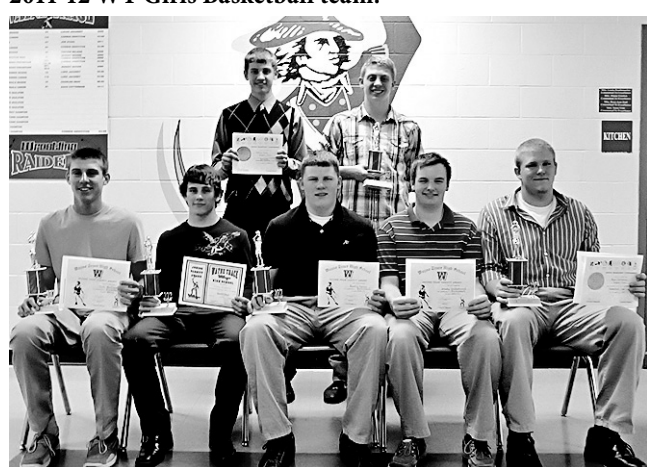
2011-12 WT Girls Basketball team.