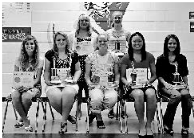
2011-12 WT Girls Basketball team.