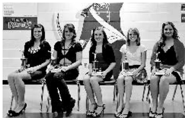
2011-12 WT Girls Basketball team.