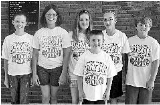
These students earned between 300 and 399 points for the school year. This group includes a first grader!