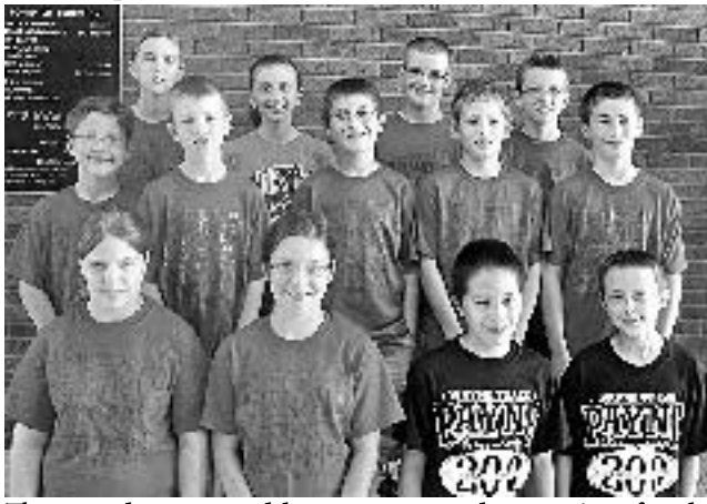
These students earned between 200 and 299 points for the school year.