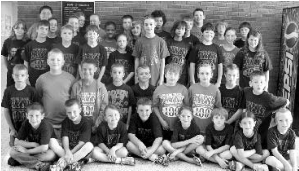
These students earned between 100 and 199 points for the school year.