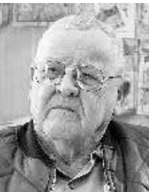
PHILIP KEARNY, JR.