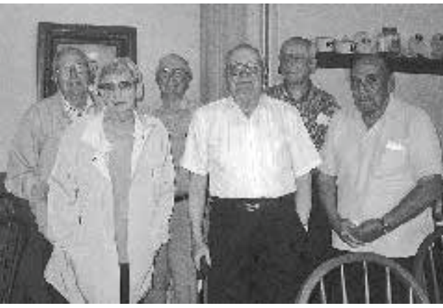
The Paulding High School class of 1941 celebrated their 69 th class reunion on Saturday, May 15, 2010 at the Vagabond Restaurant.