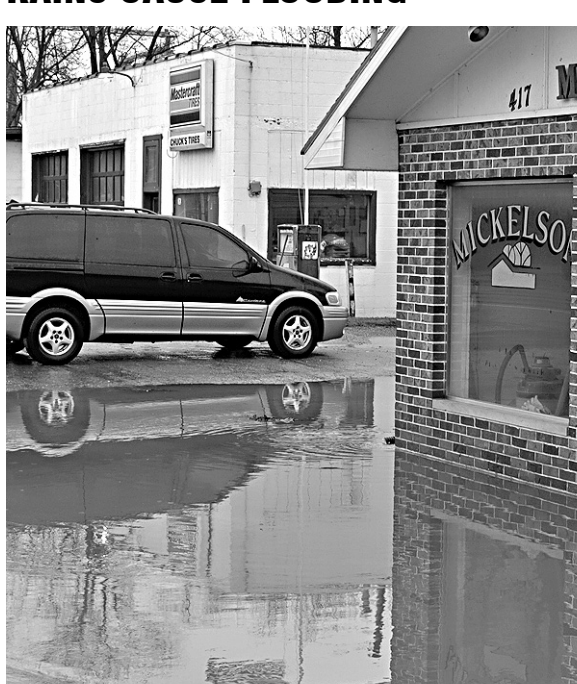
Local flooding & high winds throughout the readership area has caused numerous problems and shown several existing. Many homes owners along with business people have seen the water coming into their places along with damage from high winds.