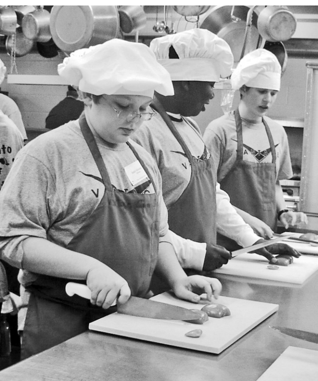
These 8 th grade guys learn how to prep vegetables the correct way for their chicken quesadillas during "Step Into Your Future" at Vantage.

Have you ever wanted to weld? Or tear apart a computer and put it back together again? Or put on a chef hat and create a new and exciting recipe in the kitchen?