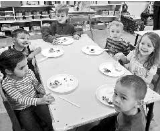
The 3 and 4 year old class at Divine Mercy Payne Preschool enjoyed decorating Christmas cookies for a snack recently.