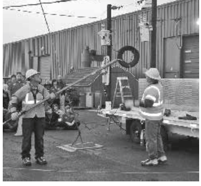
Vantage SkillsUSA students listen carefully as representatives from Paulding Putnam Electric Co-op explain and demonstrate high voltage safety.