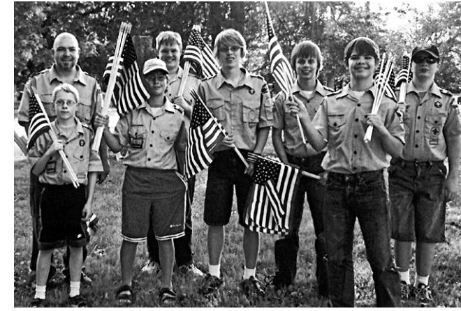
The Antwerp VFW Post 5087 Ladies Auxiliary wants to thank the Antwerp Boy Scout troop for the great job in flagging the graves in Antwerp.