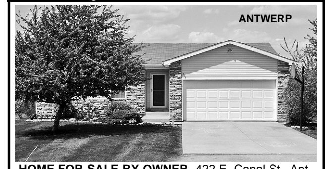
HOME FOR SALE BY OWNER. 422 E. Canal St., Antwerp. Over 2000 sq. ft., 3+ bedrooms, 2 full baths, central air, 3 season room and much more! 419-258-2701.

For Sale By Owner listings in the West Bend News