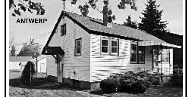
SMALL 2 BEDROOM HOME FOR SALE. 304 W. Canal, Antwerp. All hard wood floors, new furnace, one story home w/ a full basement, washer/dryer included. Large lot with outbuilding. 419-542-6228. 18-21p

Ready to Sell? Call the West Bend News 419-258-2000