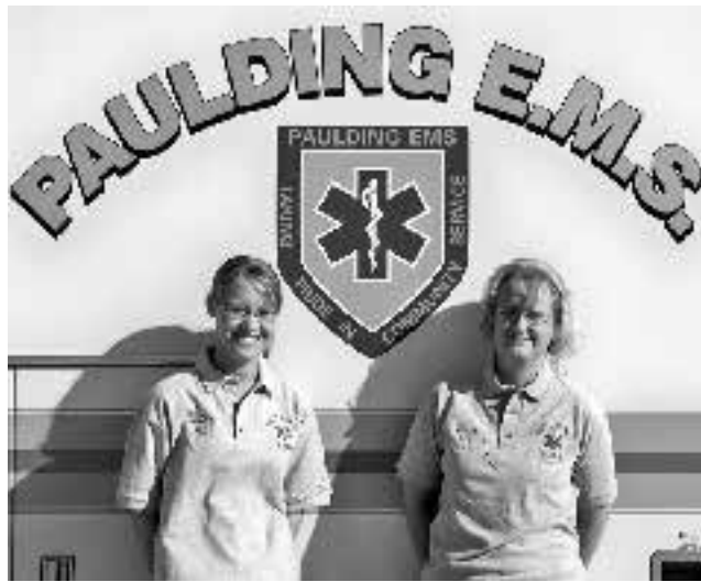
In honor of EMS week (May 17-23) members of Paulding EMS will be taking blood pressures and checking blood sugar levels at Chief Supermarket, each day from 11:00 a.m. till 2:00 p.m.

broadcast two hours a day at IPFW's radio station (WIPU) located at Kettler Hall. Then, on July 30, 1979 at 3:00 p.m., NEIRRS began broadcasting from its own studio at the library's Little Turtle branch - signing on as a sub-channel of WBCL - and has been broadcasting ever since. In 2004 NEIRRS became part of the Allen County Public Library.