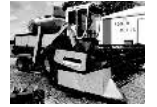
GLEANER L3 COMBINE

1984 CASE/IH 2294 MFWD Tractor, 3,660 Hrs Cab, Air, 12 Speed Power Shift Trans, 20.8-38 Tires & Hub Duals, 16.9-28 Frt. Tires, Dual Remotes, "Nice Tractor"; 1986 CASE/ IH 3394 MFWA Tractor Cab, Air, Power Shift Trans, 18.4-42 Tires & Duals, Frt. Wts, Dual Remotes, Quick Hitch, Shows 3,314 Hrs.; 1976 IH 986 Tractor, Cab, Air, 3630 Hrs, 16.9-38 Tires & Duals, Dual Remotes, 10 IH Frt. Wts., New Injection Pump; 1983 GLEANER "L3" Diesel Combine 30.5-32 Tires App. 3700 Hrs., Chopper, Monitors; Gleaner 320 Flex Grain Head, "Head Newer then Machine"; Gleaner 6x30" Low Profile Corn Head, Good Straight Machine; 1984 Honda 125 3 Wheeler