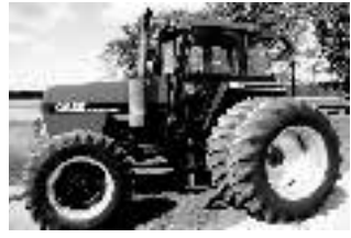
CASE/ IH TRACTORS

AUCTION LOCATION: 21271 Rd 48 Grover Hill, Ohio 3 Miles East of Grover Hill, Ohio on SR 114 to Co. Rd. C-177 North on C-177 1 Mile to Twp. Rd 48 then East to Auction