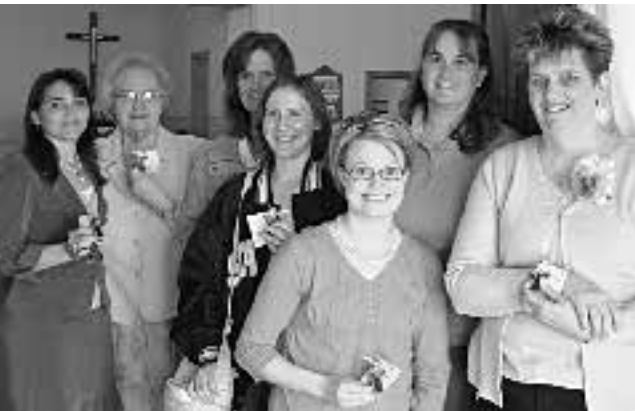
A group of South Scpio UBC mothers holding the stained glass angels crafted by Mike Emenhiser.

Mother's Day Sunday included several special features at South Scpio United Brethren in Christ church. All mothers in attendance received angel ornaments designed and crafted by Mike Emenhiser and featuring glass from an old SSUBC window. Three women received additional prizes for meeting such