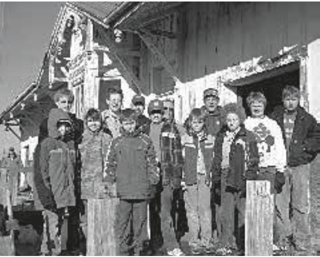
The Boy Scouts of Antwerp worked Saturday, March 29, 2008 in efforts to restore the train depot on US 24 along with the ACDC and other community members.