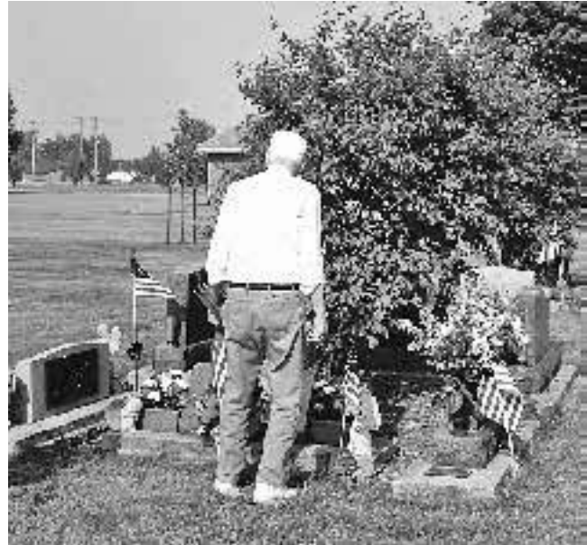
The boy scout troop 143 along with the VFW and American Legion prepared veterans graves for Memorial Day at the local cemeteries.

County Health Department. She reported fifty-five participants in the nutrition education program.