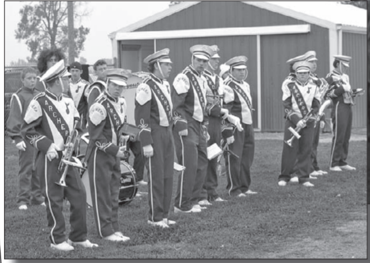
The Archer Band preparing for the march onto the field.

There is a lot more that goes into a football game than just what happens on Friday nights. These players train and work out many hours a week.