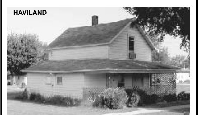
FIXER UPPER! 2/3 BR, 1 bath. We outgrew it before we finished. Upstairs remodeled w/ new windows. Finished and heated shop and shed. $19,500.00, 419-587-3090. tf

READY TO SELL? CALL THE WEST BEND NEWS TODAY!