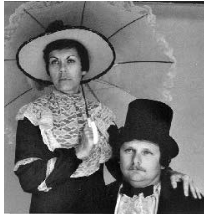
"And they said it wouldn't last!" Happy 40th anniversary!