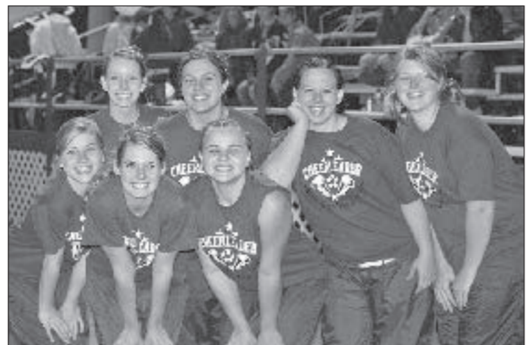
The Archer Cheerleaders pose for the West Bend News photographer