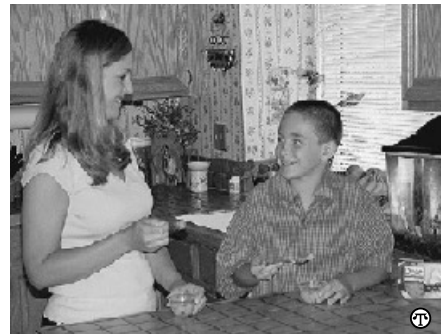
Many families find the idea of snacking on fruit is one that can really grow on them.

(NAPSA)—It's never too early—or too late—for parents to set a good example by establishing good eating habits and providing healthful foods for children, especially when it comes to snacks. The United States Department of Agriculture (USDA) guidelines recommend up to two cups of fruits a day, reinforcing the importance of healthful eating for parents and kids.