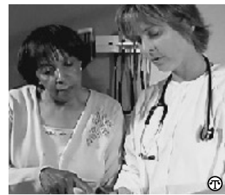
A recent study found racial disparities in treatment of chronic pain.

"This study validates what most Latinos have known for a