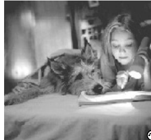
A LESSON FROM THE MOVIES—In a heartwarming film, a young girl and an entire town are changed by a scruffy, fun-loving pooch.

Child experts say that pets are not only good companions, they can teach a child compassion. A pet helps a young person develop a sense of responsibility as he or she