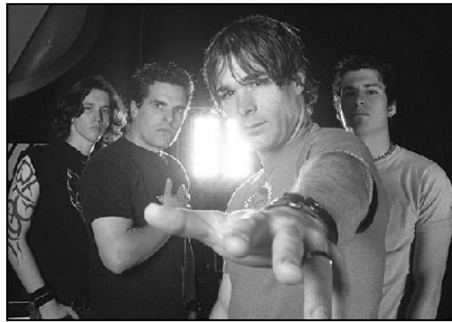
"BROKEN YOKE" CHRISTIAN BAND

Pioneer Christian Ministries is sponsoring a youth revival.