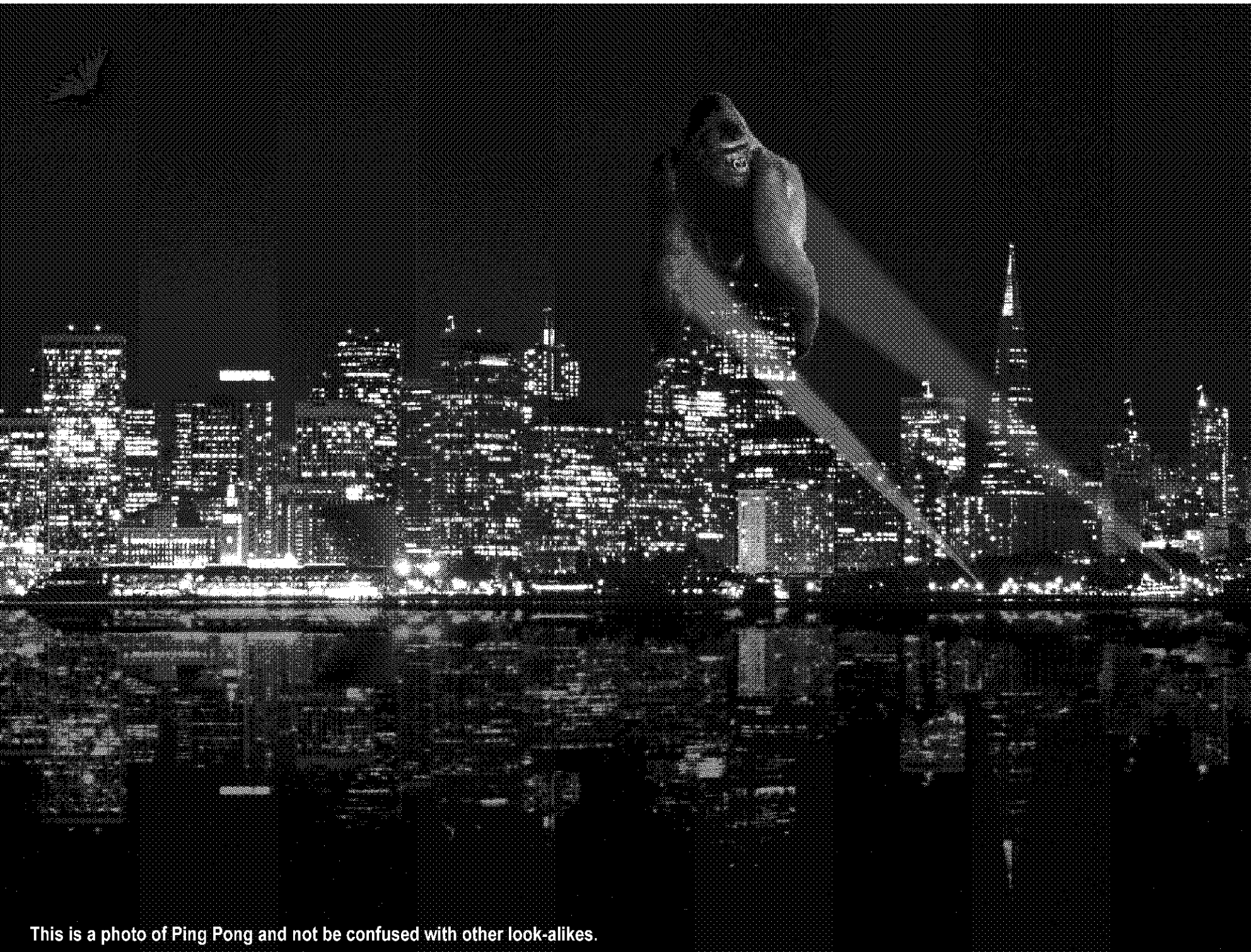
This is a photo of Ping Pong and not be confused with other look-alikes.